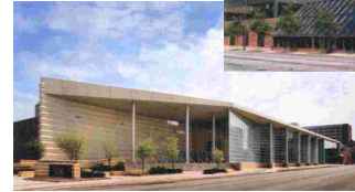
Grand Wayne Convention Center