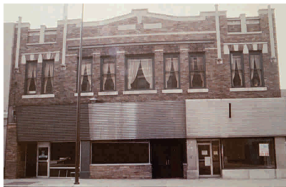
The "113" Club

The Grand Wayne Convention Center is a beautiful modern place with ample space for registration where you pick up