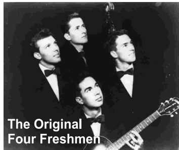
The Original Four Freshmen

Imagine the excitement of that first performance at the "113" Club. Four young men with a new concept in jazz harmony and a romantic feel for the love songs they sang with great heart. A less than auspicious start led them to much hard work and their discovery by Stan Kenton two years later. What fun we'll have reliving that excitement at the 2013 Convention.