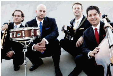
The Current Four Freshmen